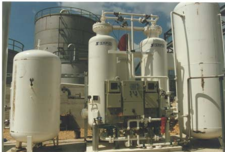
One of the self-production plants of the Sapio group, which has stations scattered throughout Italy.

All this regardless of the size and topology of the data collection basin which, for Sapio, is the whole of Italy, and the location of the decision-making divisions.