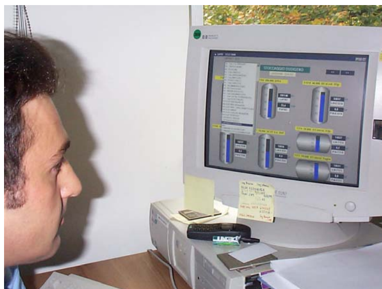
A telemetric station based on Movicon Web Client, installed in the offices of the engineering division of Monza (MI). Thanks to Web Client technology, the office is linked to the Movicon server to which the data of the telemetric system are sent.

The updated data, which represent the operating status of the remote controlled, unmanned plants, are also required by the maintenance department which now has the tool it needs to keep plant operation under control: it acts where required by remote control, restores the operating conditions of the self-production plants